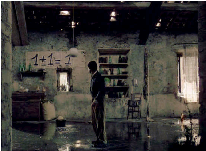
FIGURE 4. Andrei Tarkovsky, Nostalghia , 1983.

periment represented by the complete negation of any necessity of a mathematical world view in the form of a giant inscription of 1+1=1 on the walls of his dilapidated house where he kept his children locked away from the world [FIGURE 4].