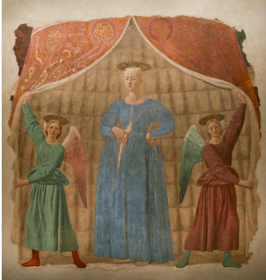
FIGURE 3. Piero della Francesca, Madonna del parto , 1459-67, Chapel of the Cemetery, Monterchi.

Piero's Madonna is an instance of the Piero type [FIGURE 3]: a type of ideal human being of his own creation, the type for which he is sometimes described as an enigmatic painter. My reading of this type is that in being an embodied creature, youthful, ungendered, halfway human, but too beautiful and distant to be entirely so, it represents the very purpose of perspective for Piero, namely to construct paintings that are underwritten by the mathematical certainty of the revelation of truth in order to represent a moral world of purity promised by painting. In other words, this painting