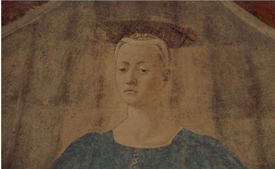
FIGURE 1. Piero della Francesca, Madonna del parto (detail), 1459-67, Chapel of the Cemetery, Monterchi.

[FIGURE 1], as well as in the “usual” mode as an apparition mediated by the lenses of the camera.