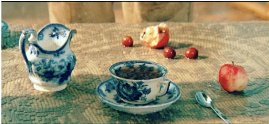
FIGURE 2. Tarkovsky, Andrei, Solaris: Still Life , 1972.

It could be said that what painting wanted, in wanting connection with reality, was a sense of presentness – not exactly of the world's presence to us, but of our presence to it. 86 [...] Photography maintains the presentness of the world by accepting our absence from it. The reality in a photograph is present to me while I am not present to it; and a world I know, and see, but to which I am nevertheless not present (through no fault of my subjectivity), is a world past. 87